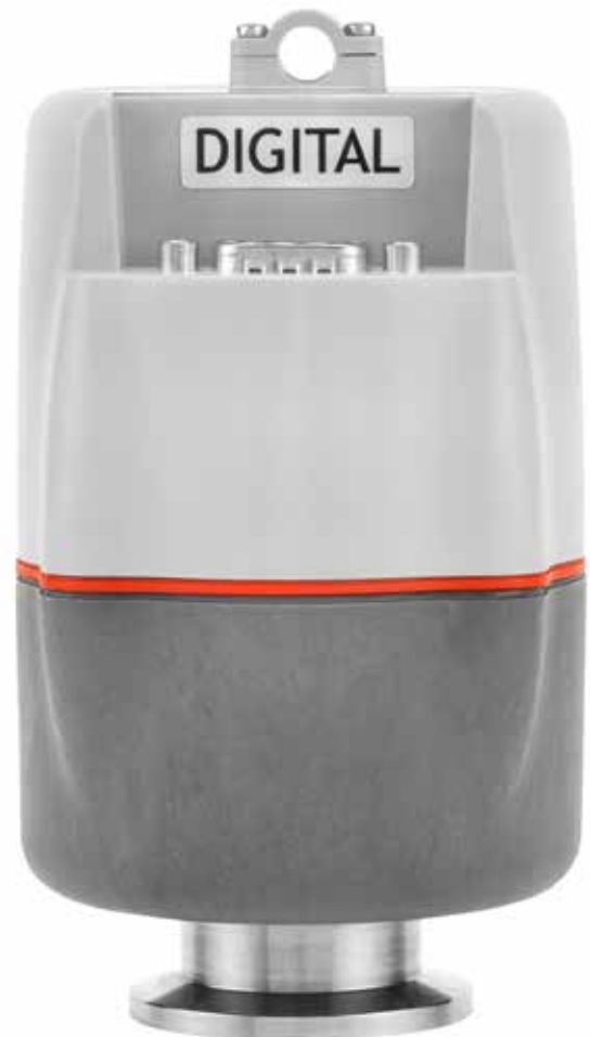
nWRG DIGITAL WIDE RANGE VACUUM GAUGE